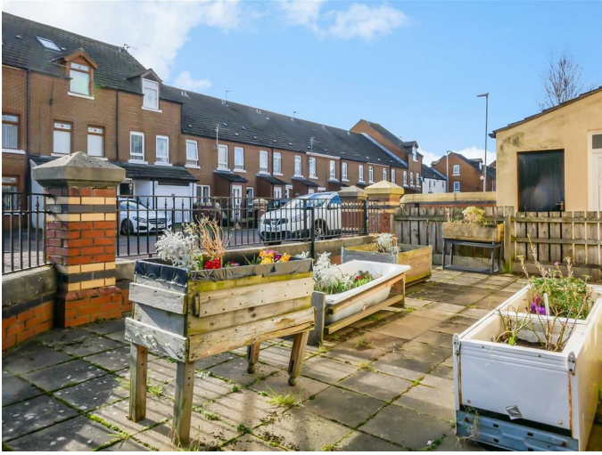
Front to side patio.