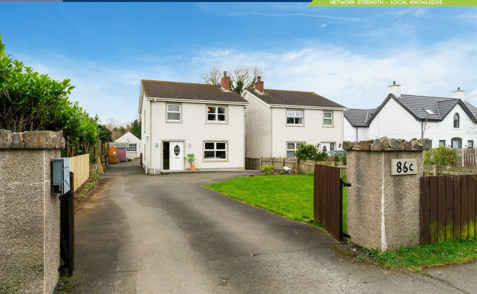
86C ANNACLOY ROAD, ANNACLOY, DOWNPATRICK, DOWN, BT30 9AJ