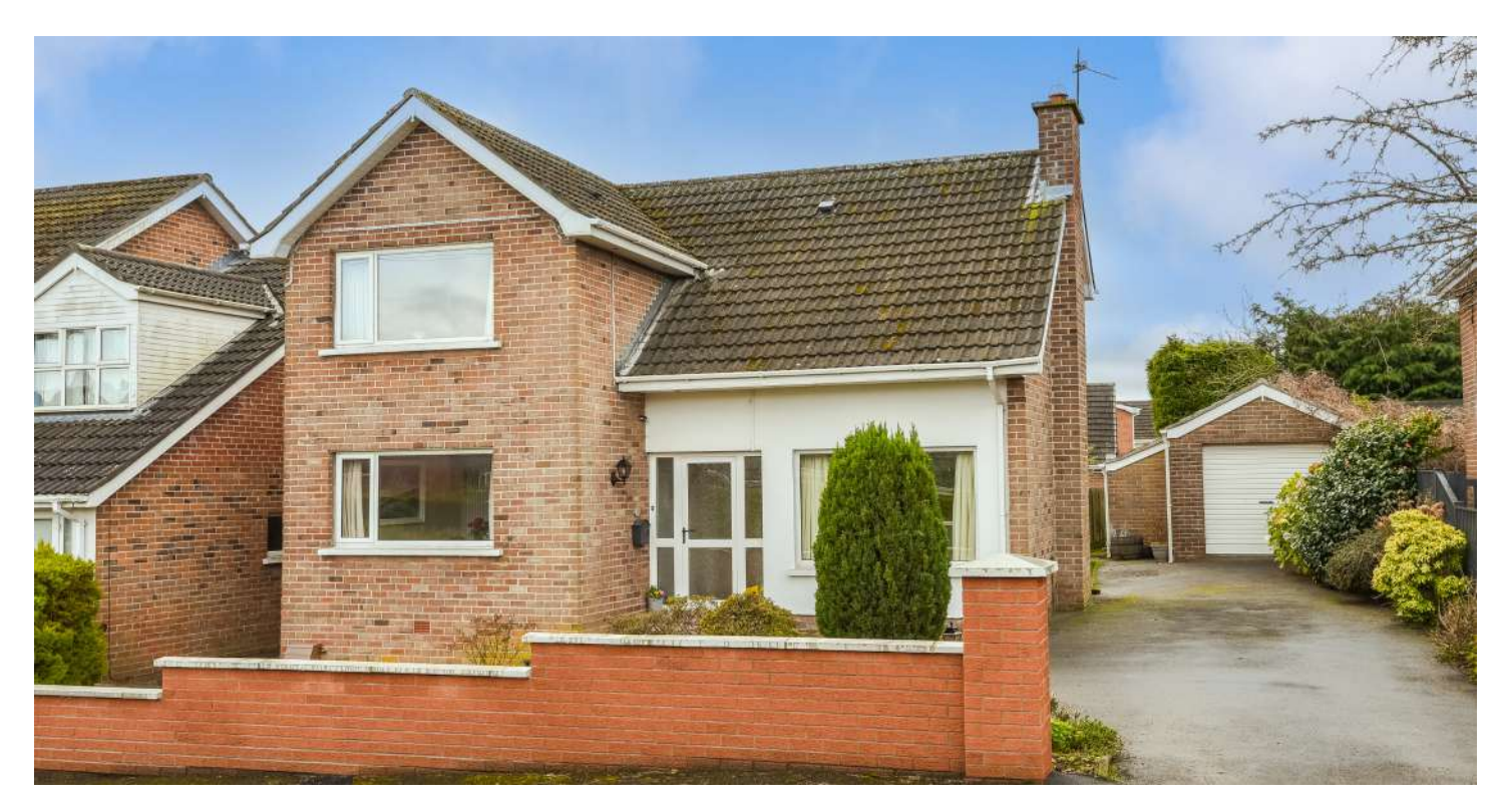
DETACHED | 3 ⊨ | 1 ≒ | 1 ⊟

This detached rustic brick family home occupies a prime position within Meadow Park enjoying the best of the sun's path with a south westerly facing rear garden. Beautifully presented throughout, with a high standard of fixtures and fittings.