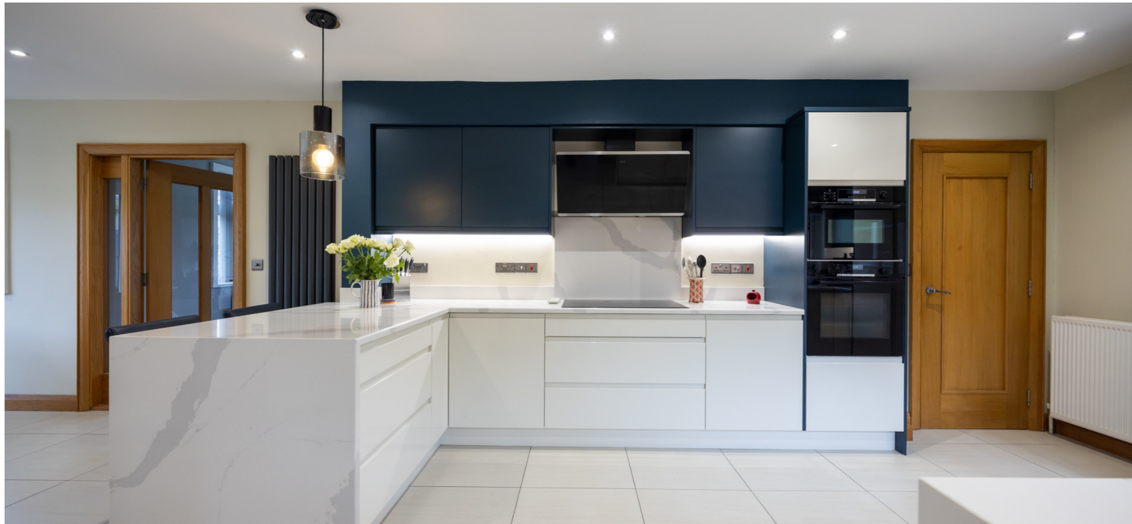
Luxury kitchen opening to dining