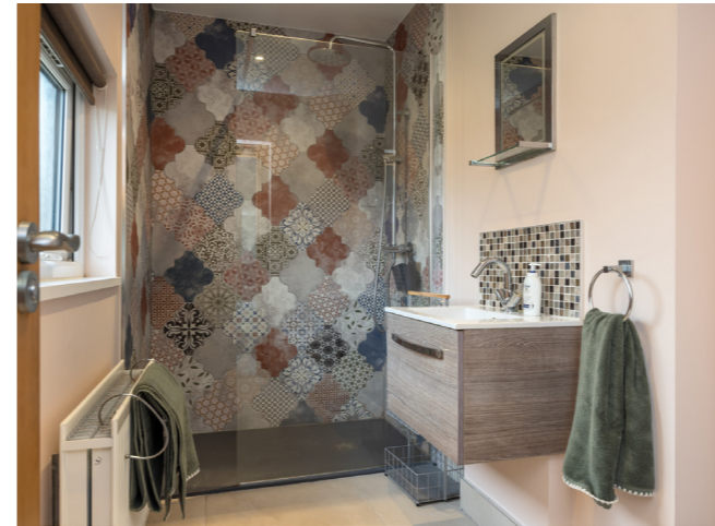
Ensuite shower room

Vaulted ceiling, bifold doors, ceramic tiled floor, bar area with breakfast bar made of reclaimed wood, space for a wine fridge, low voltage lighting, electric heat, separate wash hand basin, cabinet below, mixer tap, tiled splashback, low flush wc, ceramic tiled floor. South facing patio area.