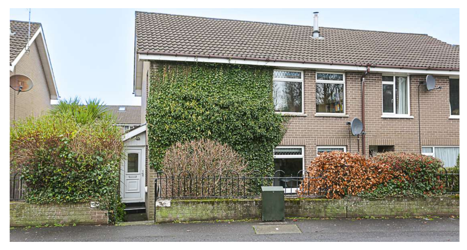
SEMI-DETACHED | 3 ⊨ | 2 ≒ | 1 ⊟

This is an exceptional home that combines style, practicality, and a convenient location, making it ideal purchase for a range of buyers.