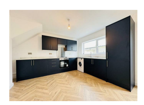
6 Princes Park Doagh Road, Newtownabbey, BT37 0BD