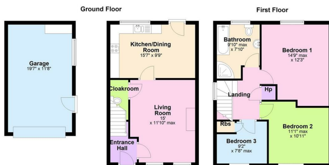
42 Woodvale, Dromara

Terms & Conditions: Please note that these particulars do not constitute an offer or contract of sale. Any prospective purchaser should satisfy themselves by thorough inspection of the property and we recommend that any prospective purchaser should employ the professional services of a building surveyor and consider their findings prior to entering into contract. All such fees associated with this work will be the responsibility of the prospective purchaser regardless of whether the sale completes or not. In addition, none of the appliances or installations have been tested in any way whatsoever and it is our recommendation that a purchaser should fully satisfy themselves by employing an appropriate expert. We would also like to advise that our measurements are taken from the widest points of each room and should not be relied upon as completely accurate. You should not make decisions based on the measurements provided and double check measurements at all times. Valuation/Mortgage Service: As part of our service we would remind Vendors and potential purchasers that we have a Mortgage Broker available at this branch. If you are thinking of selling, we would be happy to carry out a free market appraisal of your property.