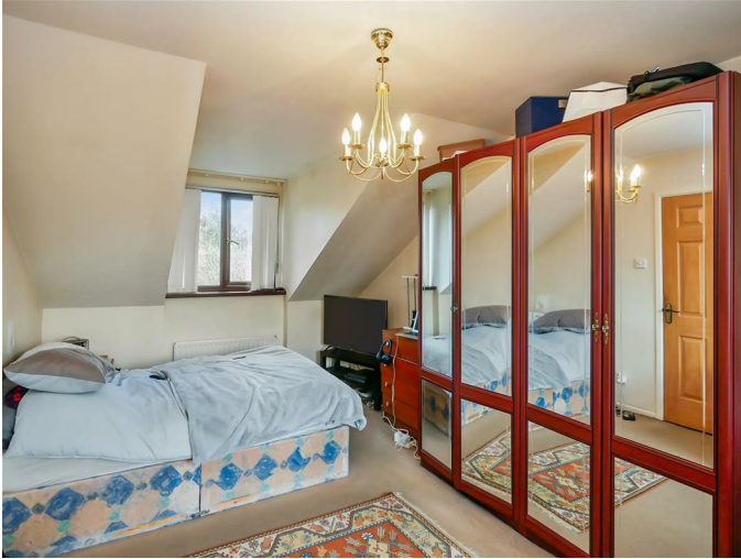
Bedroom Two 18'6 x 10'2 (5.64m x 3.10m)