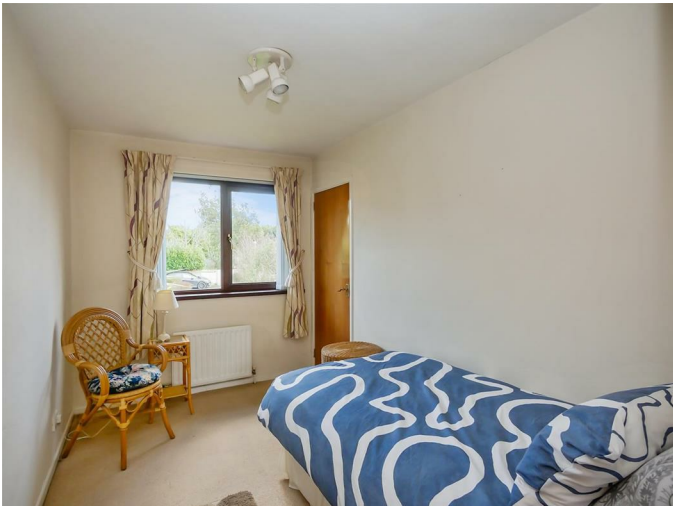
Bedroom Three 10'6 x 8'6 (3.20m x 2.59m)