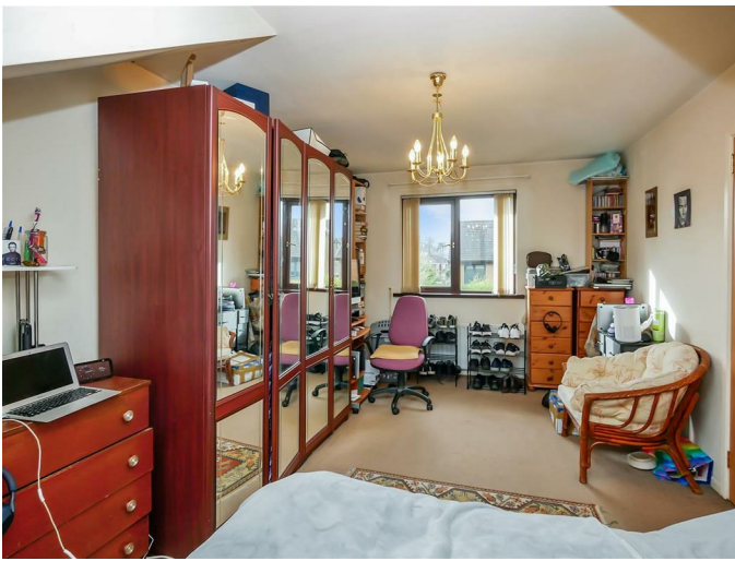
Bedroom Three 10'6 x 8'6 (3.20m x 2.59m)