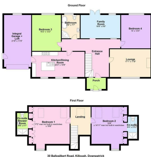
30 Ballygilbert Road, Killough, Downpatrick

Terms & Conditions: Please note that these particulars do not constitute an offer or contract of sale. Any prospective purchaser should satisfy themselves by thorough inspection of the property and we recommend that any prospective purchaser should employ the professional services of a building surveyor and consider their findings prior to entering into contract. All such fees associated with this work will be the responsibility of the prospective purchaser regardless of whether the sale completes or not. In addition, none of the appliances or installations have been tested in any way whatsoever and it is our recommendation that a purchaser should fully satisfy themselves by employing an appropriate expert. We would also like to advise that our measurements are taken from the widest points of each room and should not be relied upon as completely accurate. You should not make decisions based on the measurements provided and double check measurements at all times. Valuation/Mortgage Service: As part of our service we would remind Vendors and potential purchasers that we have a Mortgage Broker available at this branch. If you are thinking of selling, we would be happy to carry out a free market appraisal of your property.