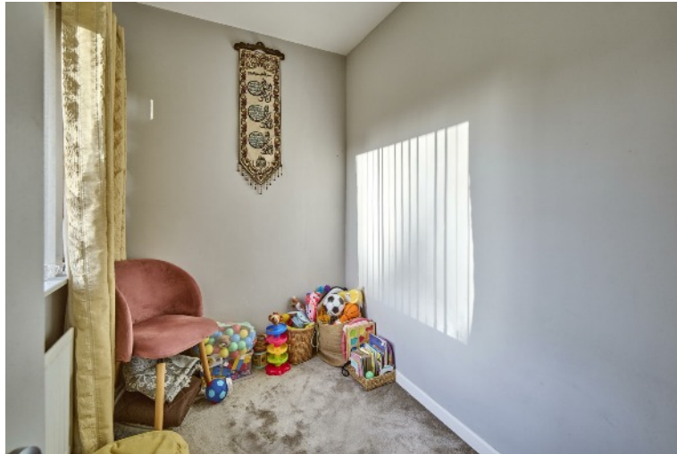
BEDROOM (2): 12' 2" x 10' 6" (3.7m x 3.2m) Wall to wall range of built-in wardrobes with cupboard above and louvered doors.