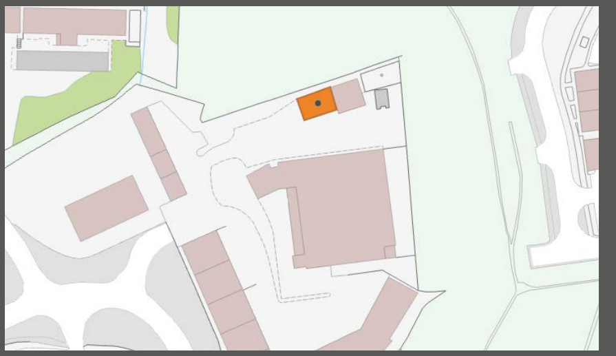
Not To Scale. For indicative purposes only.

The surrounding occupiers include Bassetts, CCT Bathrooms, The Gill Corporation, DAZN and Navico Group.