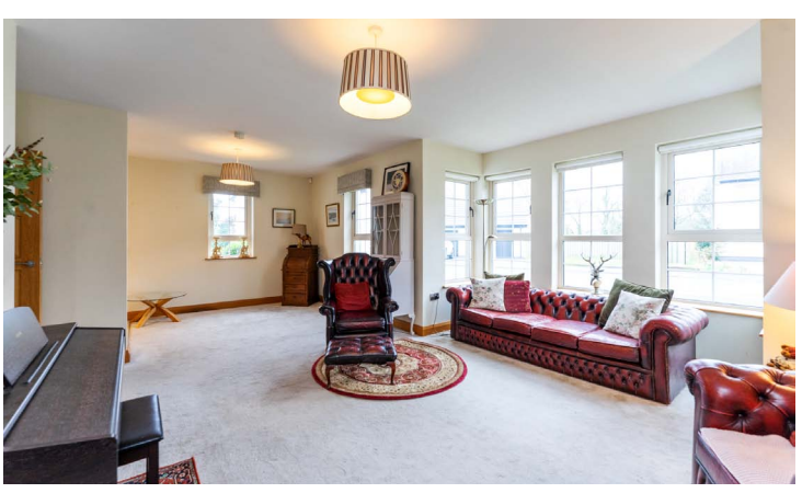
Living room openiing to dining