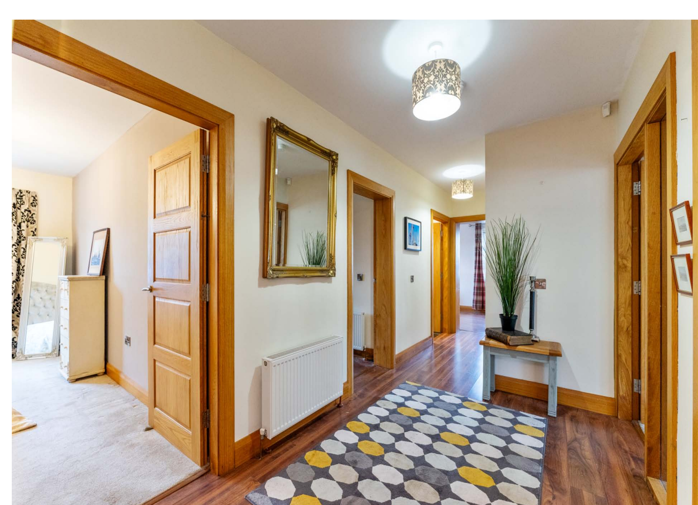
EXPERIENCE | EXPERTISE | RESULTS