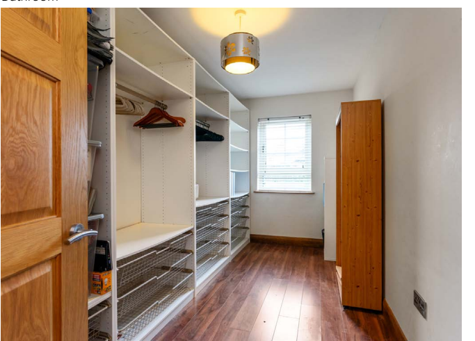
Bedroom three/study/walk-in wardrobe