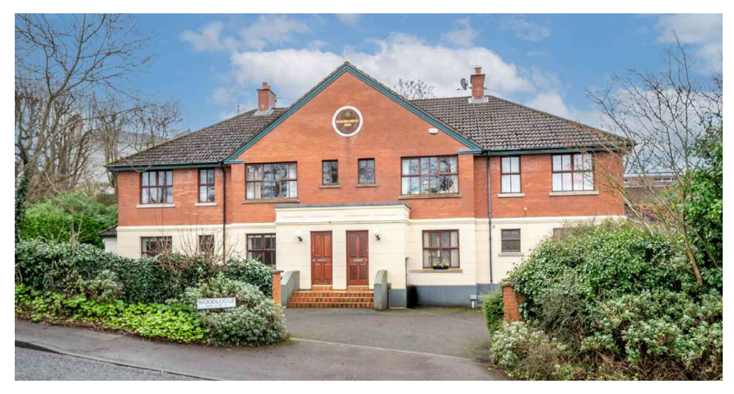
GROUND FLOOR APARTMENT | 2 ⊨ | 2 ≒ | 2 ⊟

The bright, spacious and airy apartment will suit a wide range of purchaser but is of particular interest to those downsizing with its rear garden and conservatory creating a delightful space to sit and appreciate the southerly aspect of the