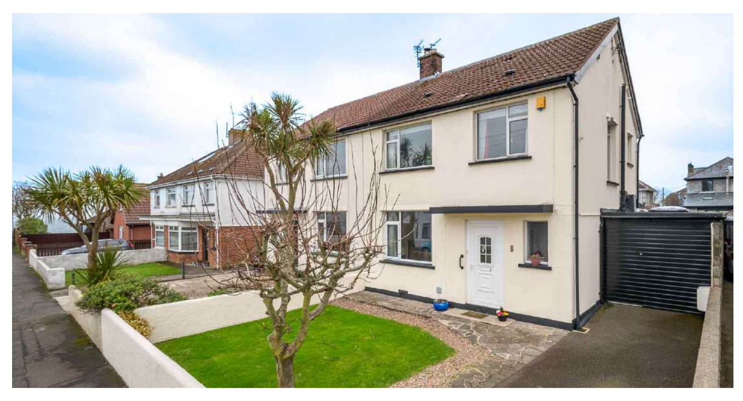
SEMI DETACHED | 3 ⊨ | 1 ≒ | 2 ⊟

Located in a very popular cul-de-sac off Millisle Road here is an ideal opportunity to purchase a semi detached property with no onward chain and direct pedestrian access at the end of the cul-de-sac onto the Commons.