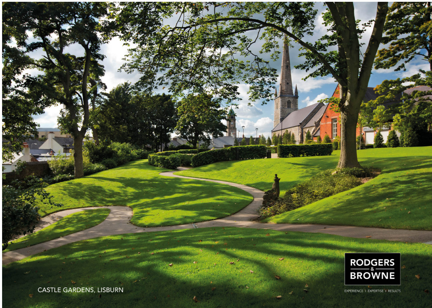
CASTLE GARDENS, LISBURN