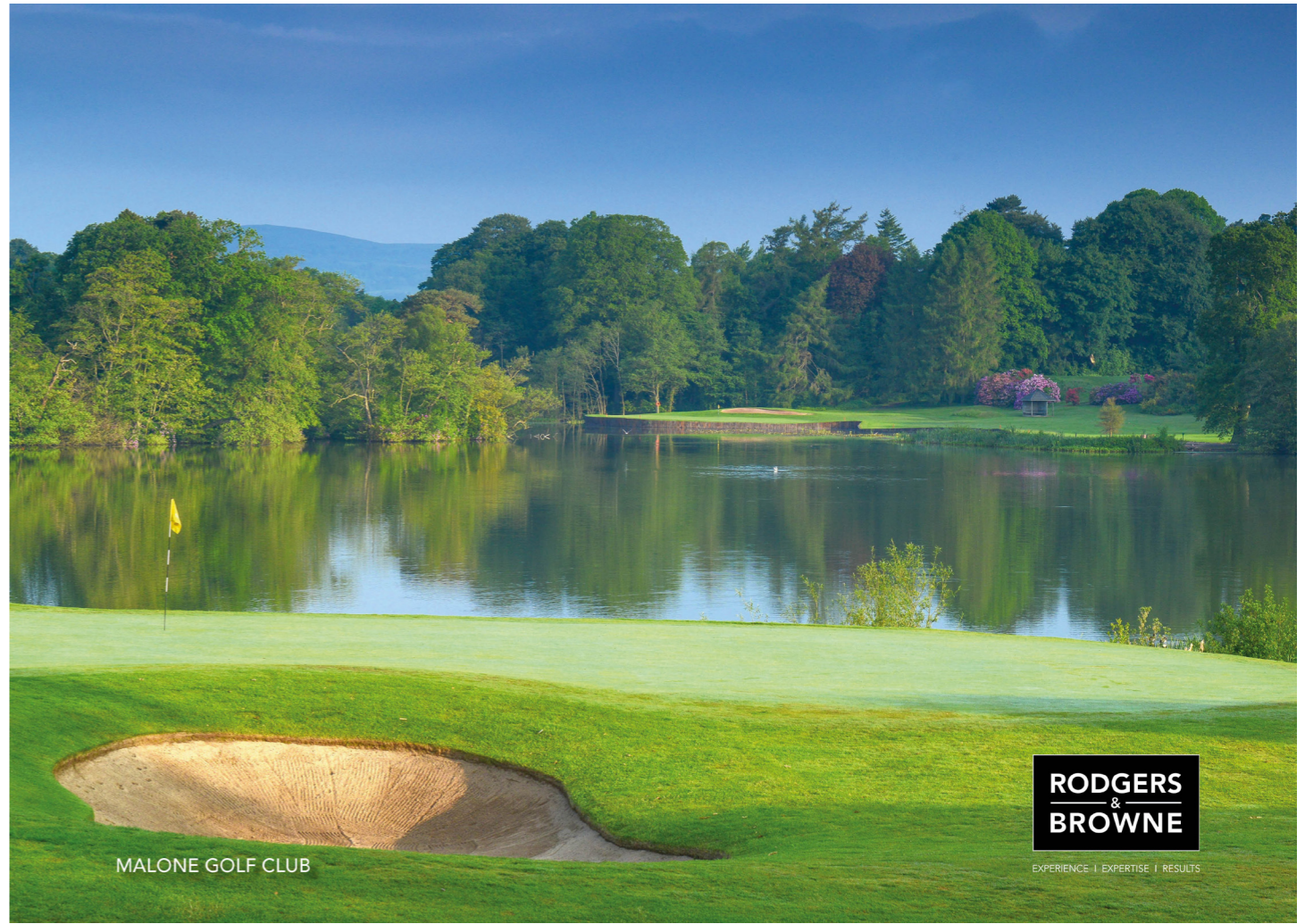
MALONE GOLF CLUB