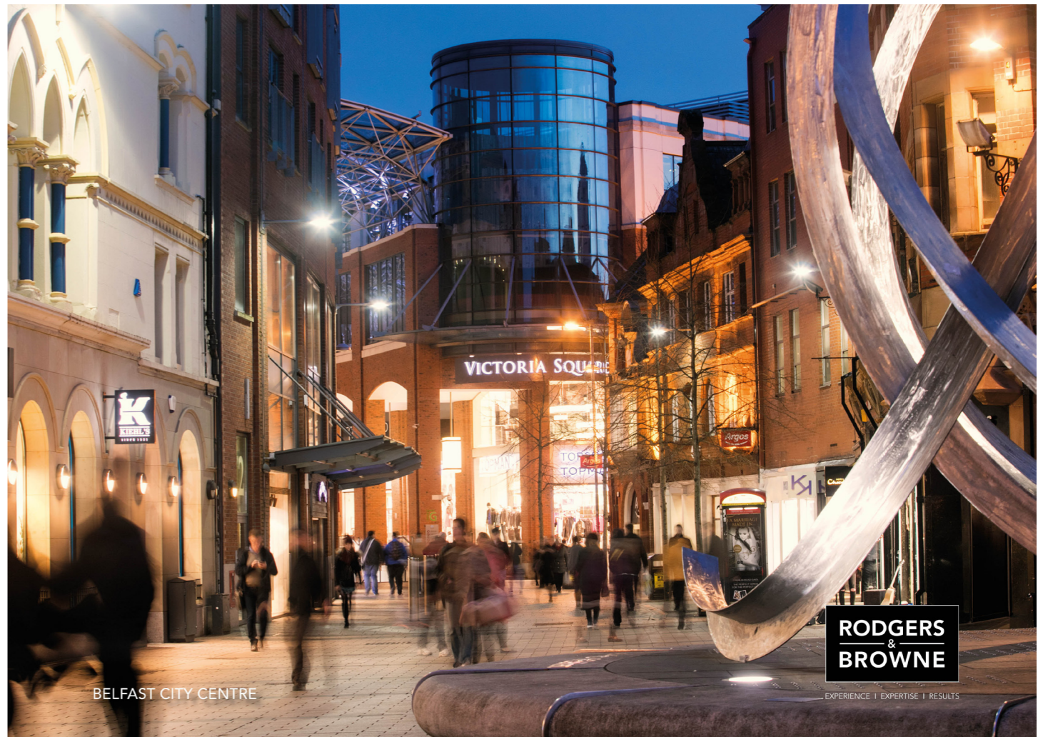
BELFAST CITY CENTRE