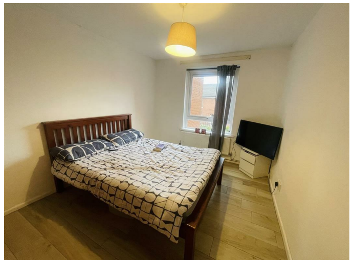
Wood effect tiled flooring and built in storage.