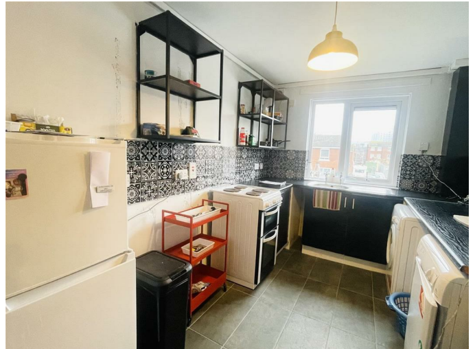
Range of high and low level units, stainless steel sink unit, plumbed for washing machine / dryer, part tiled walls and tiled flooring. Built in storage.