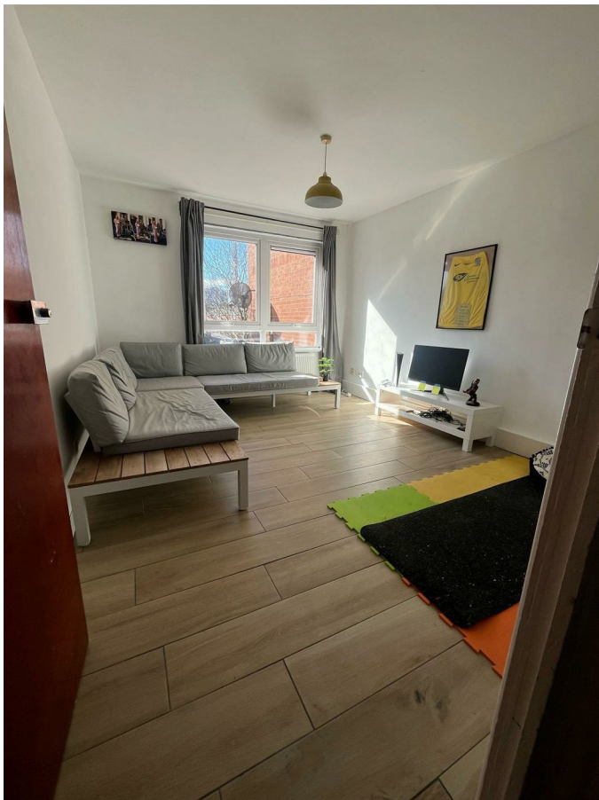
Wood effect tiled flooring.