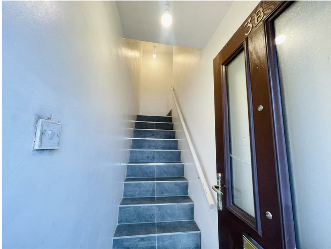
Composite front door. Steps to first floor.