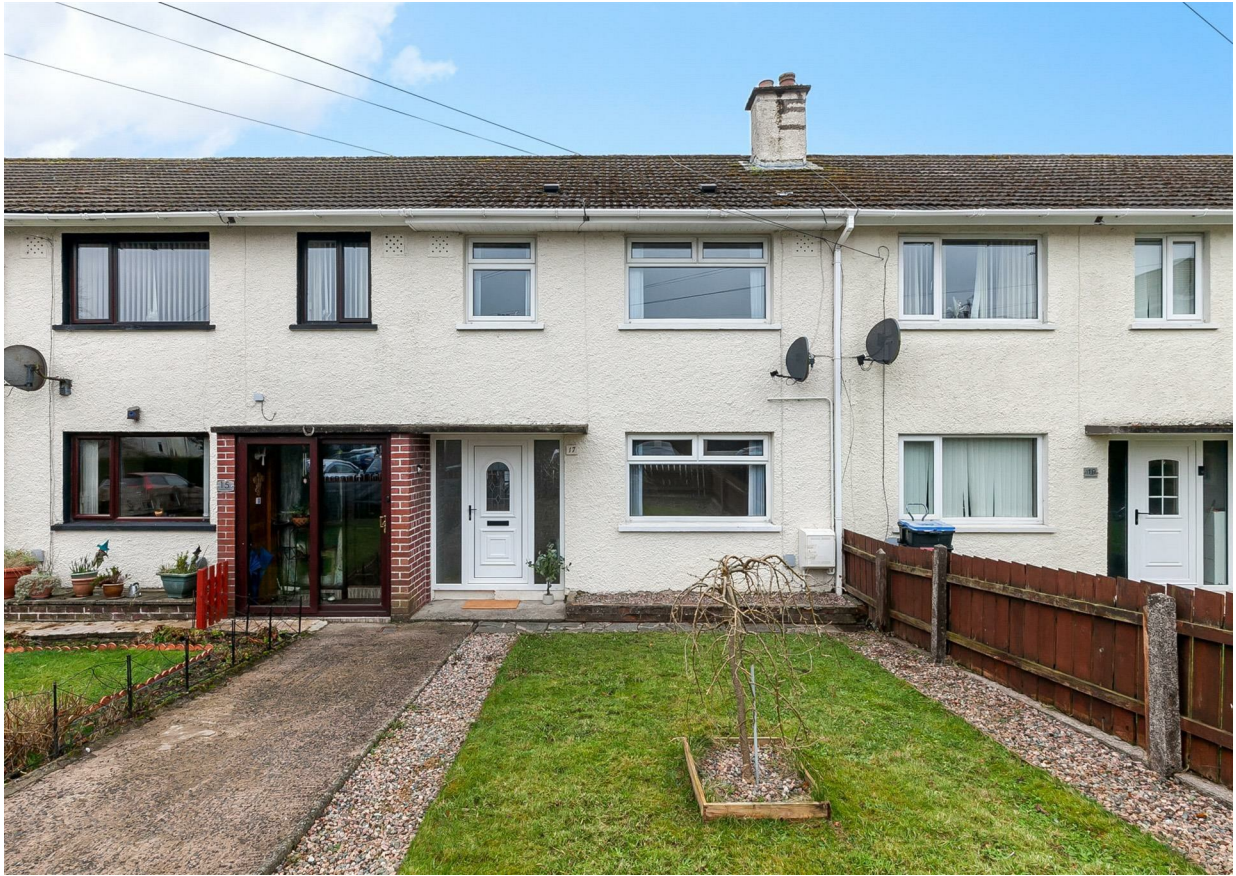
17 Margaret Avenue, Ballyclare, BT39 9HW