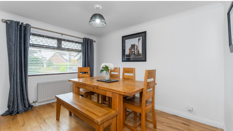
Dining room/bedroom (4)