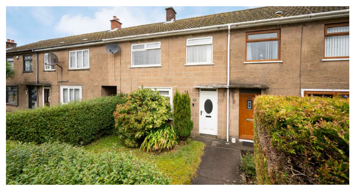
MID TERRACE | 2 ⊨ | 1 ≒ | 2 ⊟

We are delighted to bring to the market this deceptively spacious three-bedroom mid-terrace property located off the Lower Braniel Road in East Belfast.