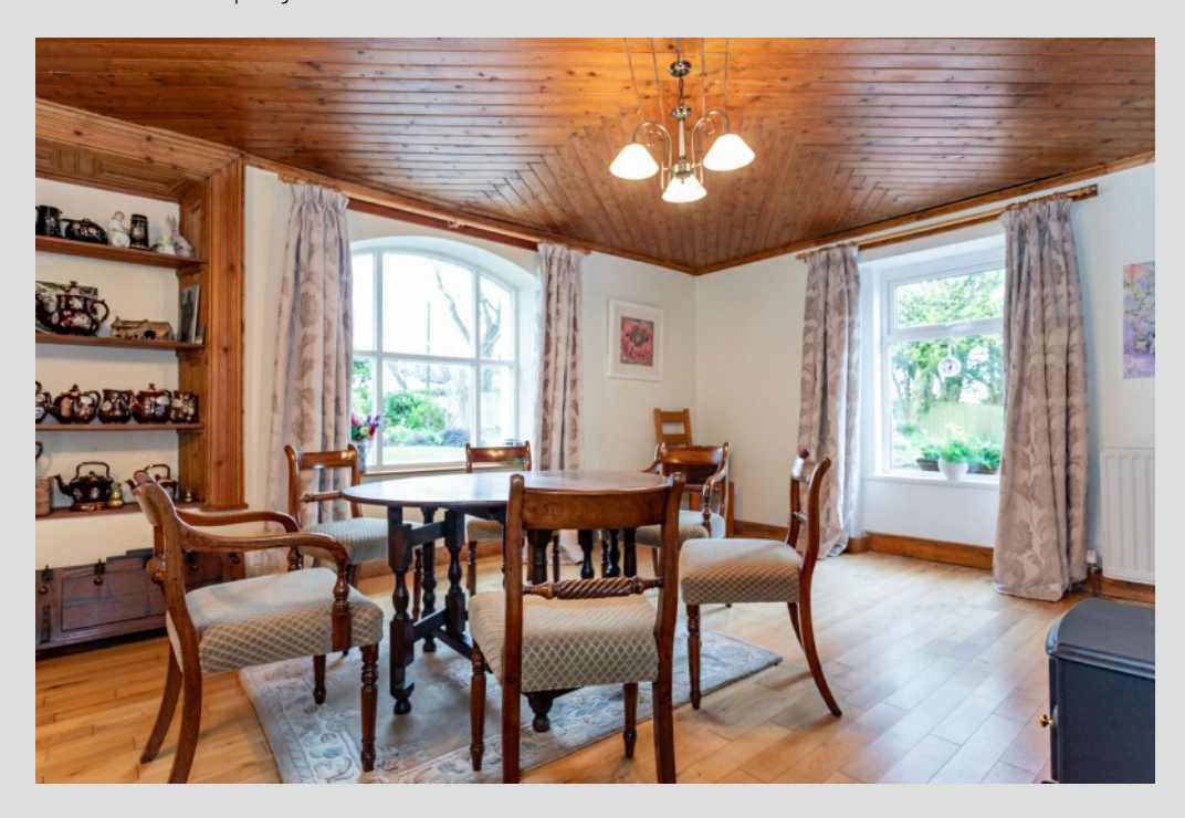
FAMILY ROOM: 16' 4'' \times 12' 7'' (4.98m \times 3.84 m) Inglenook fireplace with enclosed cast iron stove and tiled hearth, Cumberland stone surround, oak strip flooring, feature pine ceiling.

DINING ROOM: 16' 4" \times 12' 7" (4.98m x 3.84m) Oak strip flooring, original pine strip ceiling, feature pine recessed display shelf.