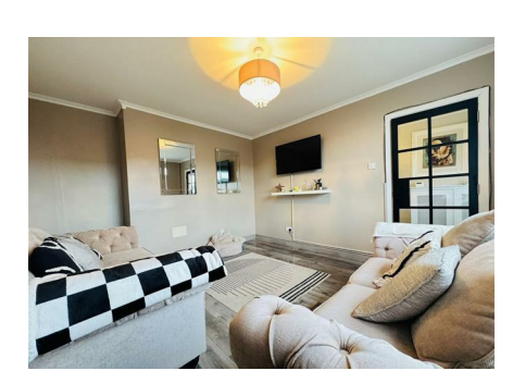
4 Killowen Terrace Rathcoole, Newtownabbey, BT37 9LH