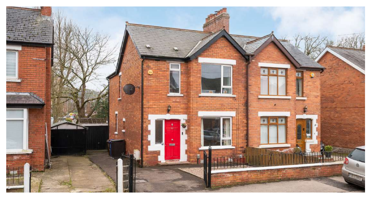
SEMI-DETACHED | 4 ⊨ | 1 ≒ | 2 ⊟

We are delighted to bring to the market this well presented four bedroom semidetached property located in the extremely highly sought after Ravenhill area of South East Belfast.