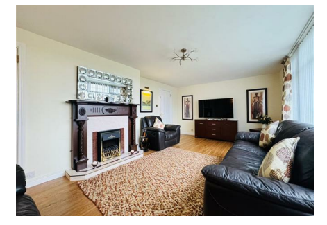
3 Hollybank Drive Monkstown, Newtownabbey, BT37 0HG