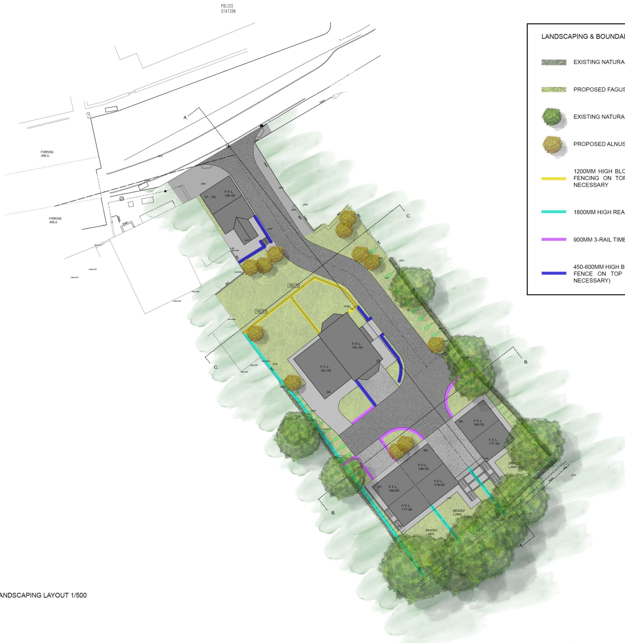
LANDSCAPING LAYOUT 1/500