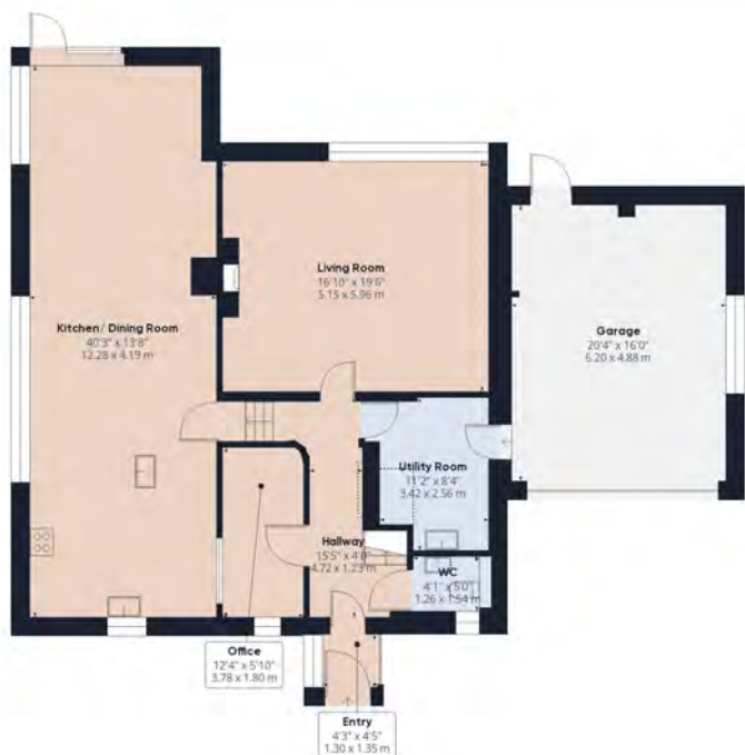
Floor 0 Building 1