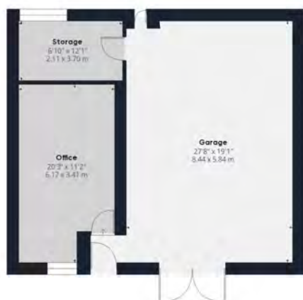
Floor 0 Building 2