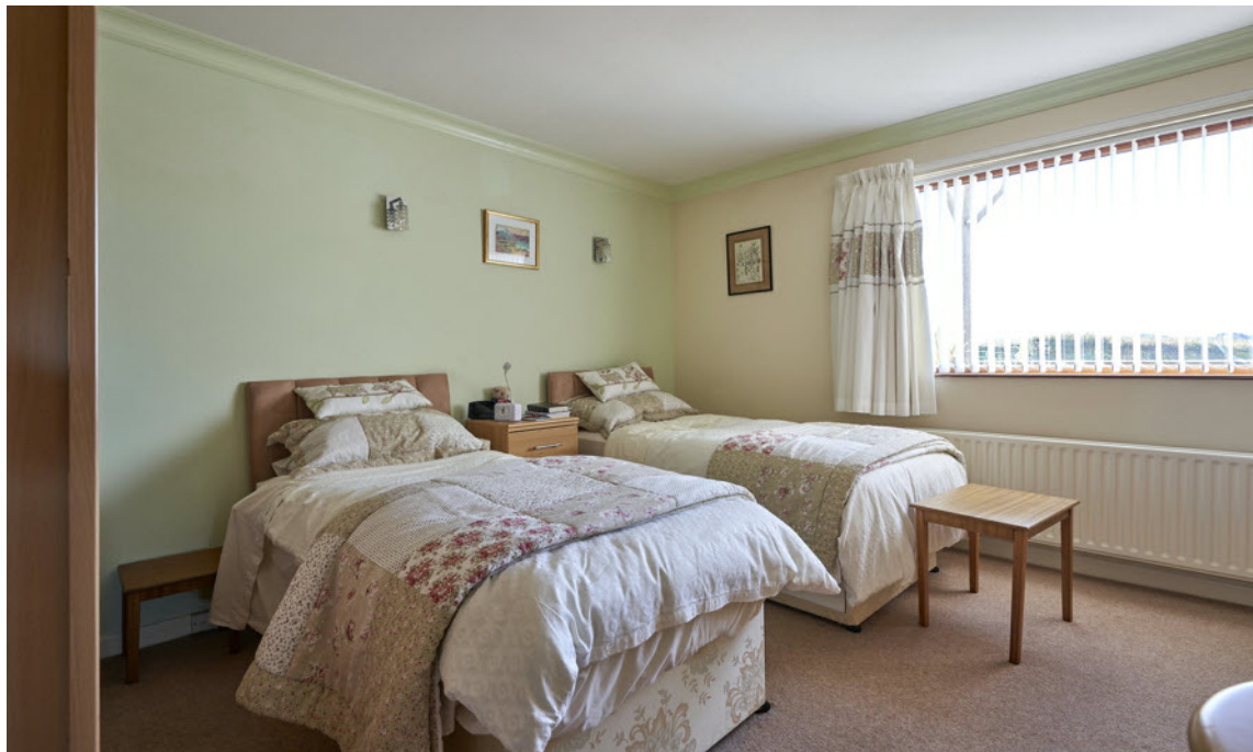
BEDROOM (3): 16' 8" x 13' 4" (5.08m x 4.06m) Range of built-in robes. Hotpress with built-in storage.