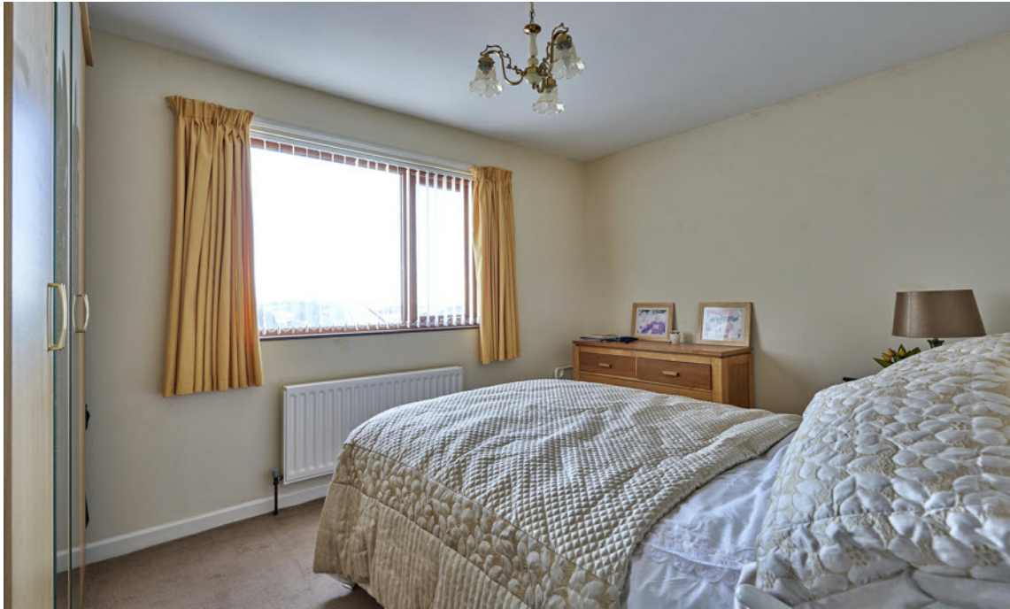
BEDROOM (2): 13' 0" x 9' 8" (3.96m x 2.95m)