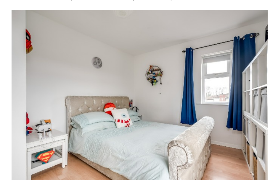
BEDROOM (3): 10' 6" x 8' 9" (3.2m x 2.67m) Wood effect flooring.