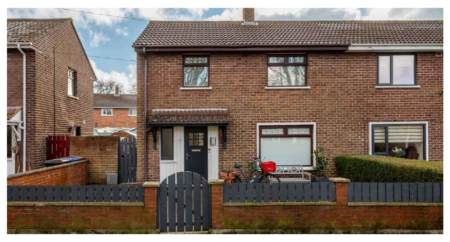
SEMI DETACHED | 2 ⊨ | 1 ≒ | 1 ⊟

We are delighted to bring to the market this well presented, deceptively spacious two bedroom semi-detached property located in the ever popular Clarawood Area of East Belfast.