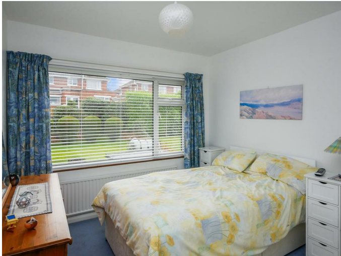
Bedroom One 12'2 x 9'5 (3.71m x 2.87m)