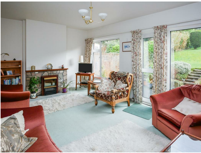
Stone fireplace. Pvc door to patio/garden.