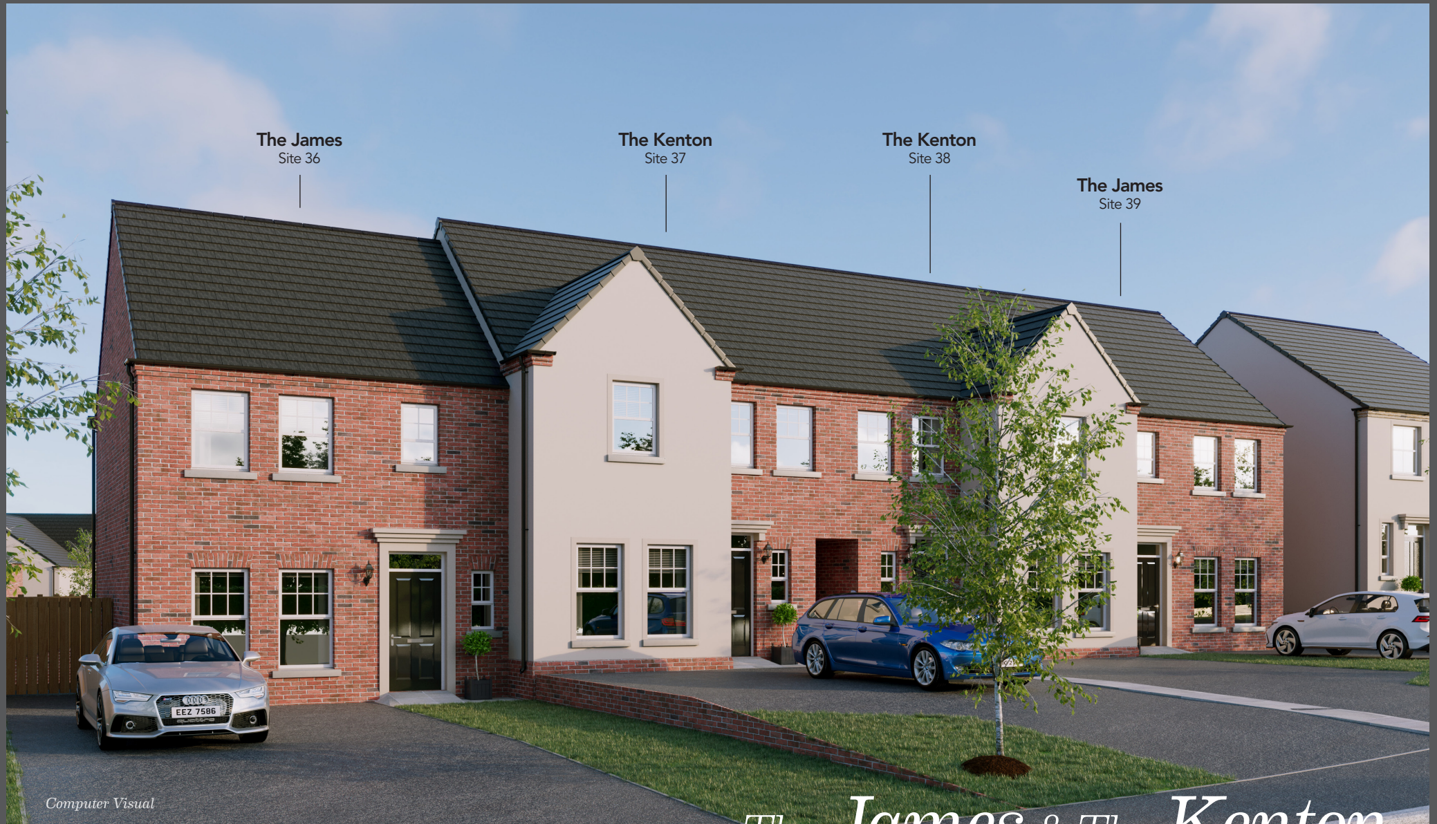
The James Site 36