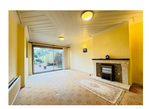
12 Swanston Road North Antrim Road, Newtownabbey, BT36 5DL