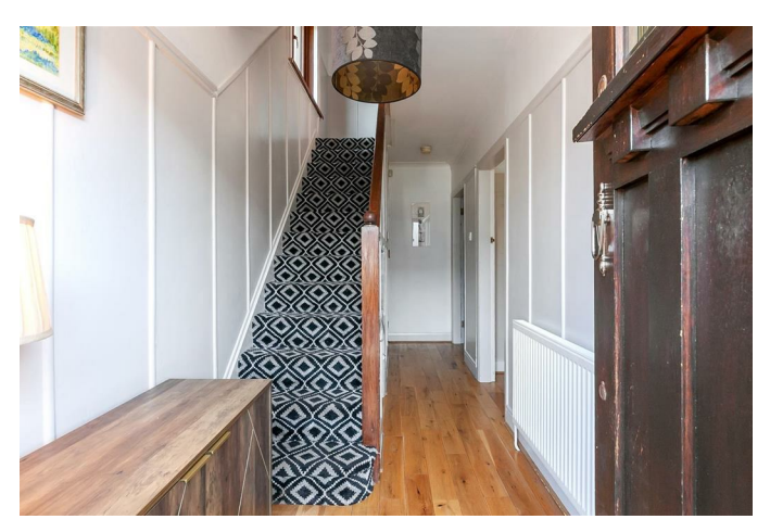
Solid wood floor, wall panelling.