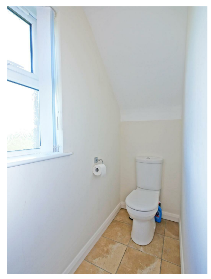
Ground floor w.c comprising of low flush w.c and wash hand basin with stainless steel mixer taps. Cream tiled flooring and tiled splashback.