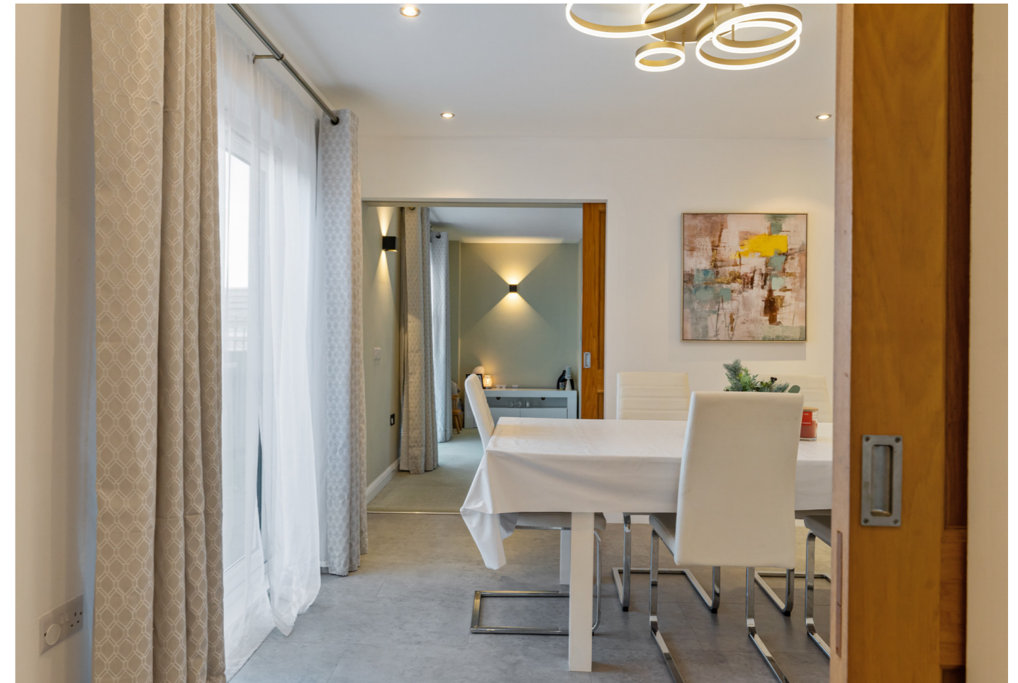
Feature pocket doors