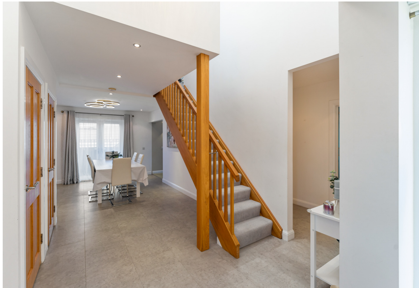
Dining reception hall