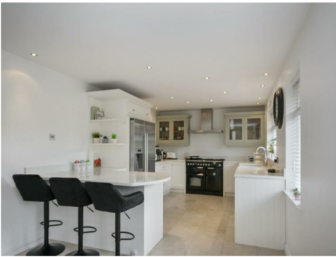
Shaker style fitted kitchen with a superb range of high and low level units, glazed cabinets, stone work surfaces, upstands and breakfast bar, stainless steel sink unit with mixer taps, plumbed for American style fridge freezer. Tiled flooring.