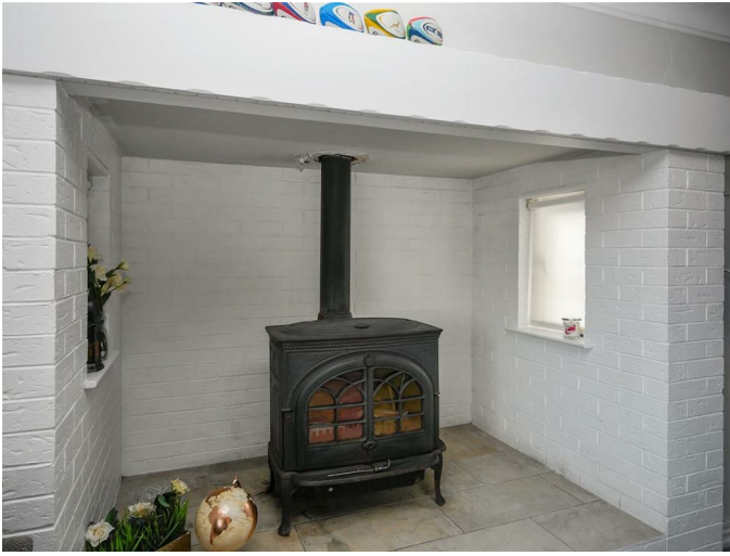
Modern Fitted Kitchen/Dining 25'4 x 9'9 (7.72m x 2.97m)