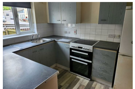
21 Cronin Park , Newry, BT34 2BZ