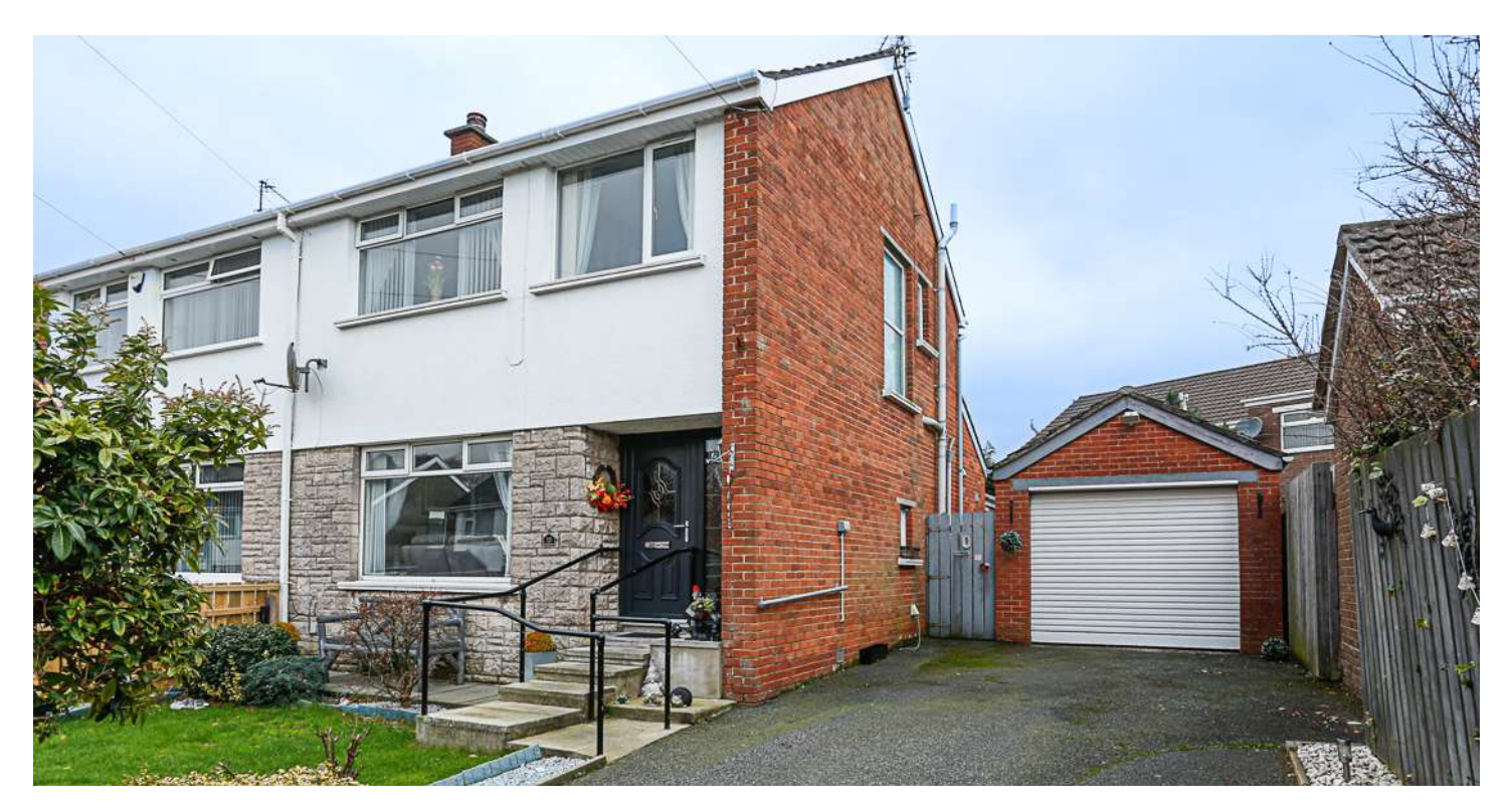
SEMI-DETACHED | 4 ⊨ | 2 ≒ | 2 ⊟

Nestled in the heart of a popular and well-connected area, 10 Auburn Park, Bangor offers a beautifully presented four-bedroom semi-detached home that provides both comfort and convenience.