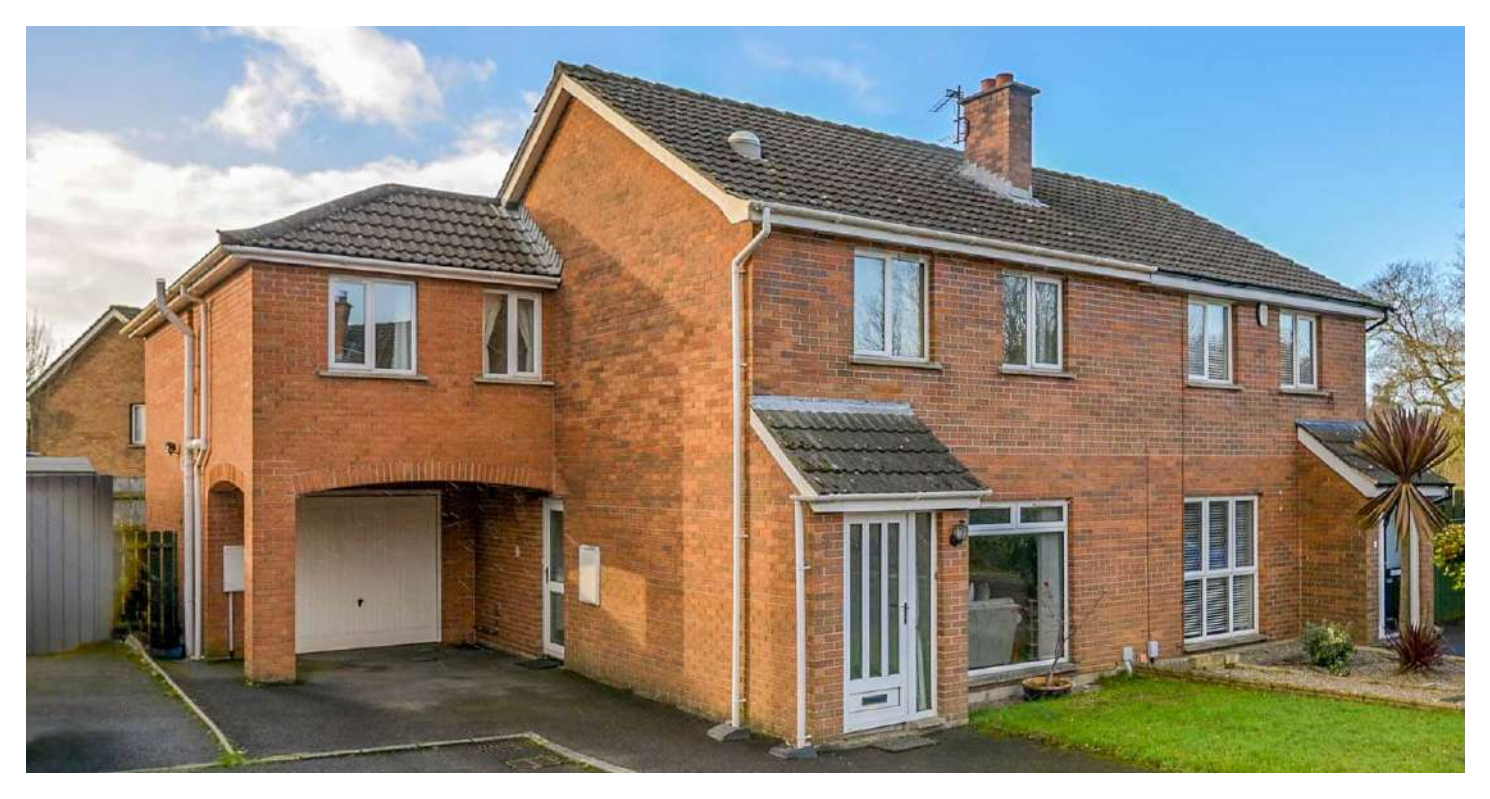
SEMI-DETACHED | 5 ⊨ | 2 ≒ | 1 ⊟

Nestled in the highly sought-after Cedar Grove area of Holywood, this charming 4 bedroom and office/bedroom 5 semi-detached home offers the perfect blend of spacious living and modern convenience, making it ideal for growing families.