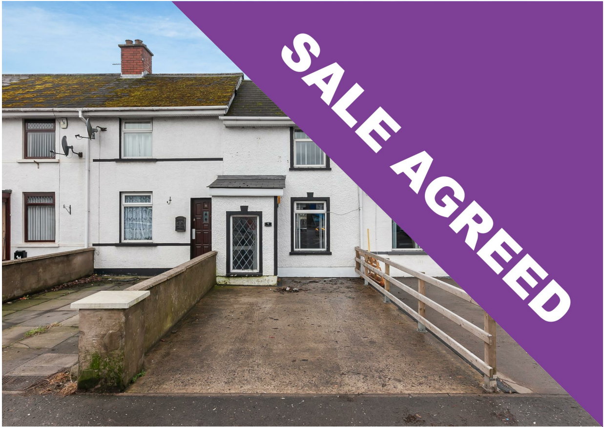
9 Station Road, Doagh, BT39 0QT