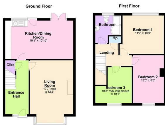
28 Lissara Close, Crossgar

Terms & Conditions: Please note that these particulars do not constitute an offer or contract of sale. Any prospective purchaser should satisfy themselves by thorough inspection of the property and we recommend that any prospective purchaser should employ the professional services of a building surveyor and consider their findings prior to entering into contract. All such fees associated with this work will be the responsibility of the prospective purchaser regardless of whether the sale completes or not. In addition, none of the appliances or installations have been tested in any way whatsoever and it is our recommendation that a purchaser should fully satisfy themselves by employing an appropriate expert. We would also like to advise that our measurements are taken from the widest points of each room and should not be relied upon as completely accurate. You should not make decisions based on the measurements provided and double check measurements at all times. Valuation/Mortgage Service: As part of our service we would remind Vendors and potential purchasers that we have a Mortgage Broker available at this branch. If you are thinking of selling, we would be happy to carry out a free market appraisal of your property.