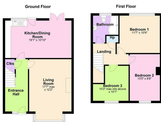
28 Lissara Close, Crossgar

Terms & Conditions: Please note that these particulars do not constitute an offer or contract of sale. Any prospective purchaser should satisfy themselves by thorough inspection of the property and we recommend that any prospective purchaser should employ the professional services of a building surveyor and consider their findings prior to entering into contract. All such fees associated with this work will be the responsibility of the prospective purchaser regardless of whether the sale completes or not. In addition, none of the appliances or installations have been tested in any way whatsoever and it is our recommendation that a purchaser should fully satisfy themselves by employing an appropriate expert. We would also like to advise that our measurements are taken from the widest points of each room and should not be relied upon as completely accurate. You should not make decisions based on the measurements provided and double check measurements at all times. Valuation/Mortgage Service: As part of our service we would remind Vendors and potential purchasers that we have a Mortgage Broker available at this branch. If you are thinking of selling, we would be happy to carry out a free market appraisal of your property.