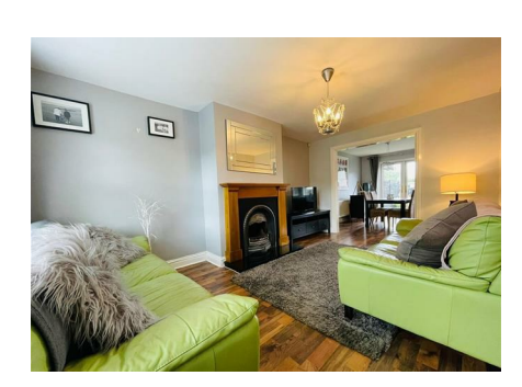
24 Dermont Court , Newtownabbey, BT36 4NU