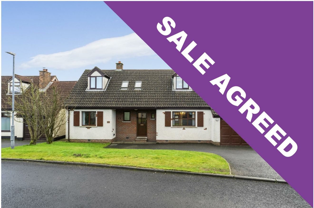
1 Holly Lane, Newtownabbey, BT36 5GU