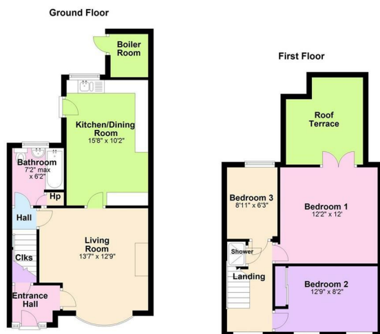
35 Rathfriland Road, Dromara

Terms & Conditions: Please note that these particulars do not constitute an offer or contract of sale. Any prospective purchaser should satisfy themselves by thorough inspection of the property and we recommend that any prospective purchaser should employ the professional services of a building surveyor and consider their findings prior to entering into contract. All such fees associated with this work will be the responsibility of the prospective purchaser regardless of whether the sale completes or not. In addition, none of the appliances or installations have been tested in any way whatsoever and it is our recommendation that a purchaser should fully satisfy themselves by employing an appropriate expert. We would also like to advise that our measurements are taken from the widest points of each room and should not be relied upon as completely accurate. You should not make decisions based on the measurements provided and double check measurements at all times. Valuation/Mortgage Service: As part of our service we would remind Vendors and potential purchasers that we have a Mortgage Broker available at this branch. If you are thinking of selling, we would be happy to carry out a free market appraisal of your property.