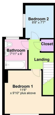
6 Abbeyview, Downpatrick

Terms & Conditions: Please note that these particulars do not constitute an offer or contract of sale. Any prospective purchaser should satisfy themselves by thorough inspection of the property and we recommend that any prospective purchaser should employ the professional services of a building surveyor and consider their findings prior to entering into contract. All such fees associated with this work will be the responsibility of the prospective purchaser regardless of whether the sale completes or not. In addition, none of the appliances or installations have been tested in any way whatsoever and it is our recommendation that a purchaser should fully satisfy themselves by employing an appropriate expert. We would also like to advise that our measurements are taken from the widest points of each room and should not be relied upon as completely accurate. You should not make decisions based on the measurements provided and double check measurements at all times. Valuation/Mortgage Service: As part of our service we would remind Vendors and potential purchasers that we have a Mortgage Broker available at this branch. If you are thinking of selling, we would be happy to carry out a free market appraisal of your property.