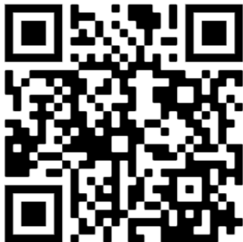
Link to Abbey Quarter