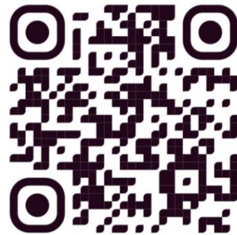
Link to Property Location