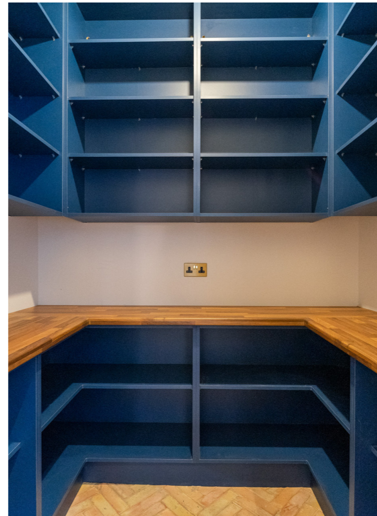
Walk in, shelved Pantry