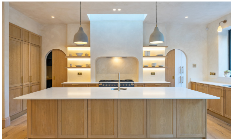
Space for dining