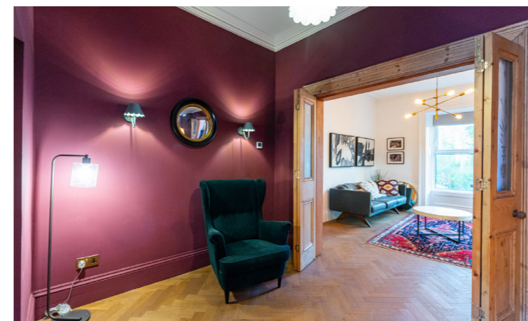
Snug/bar or reading area