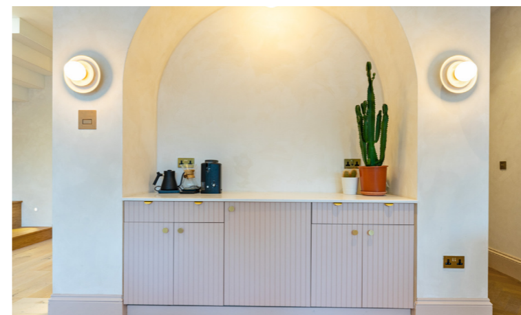
Recessed coffee / breakfast point