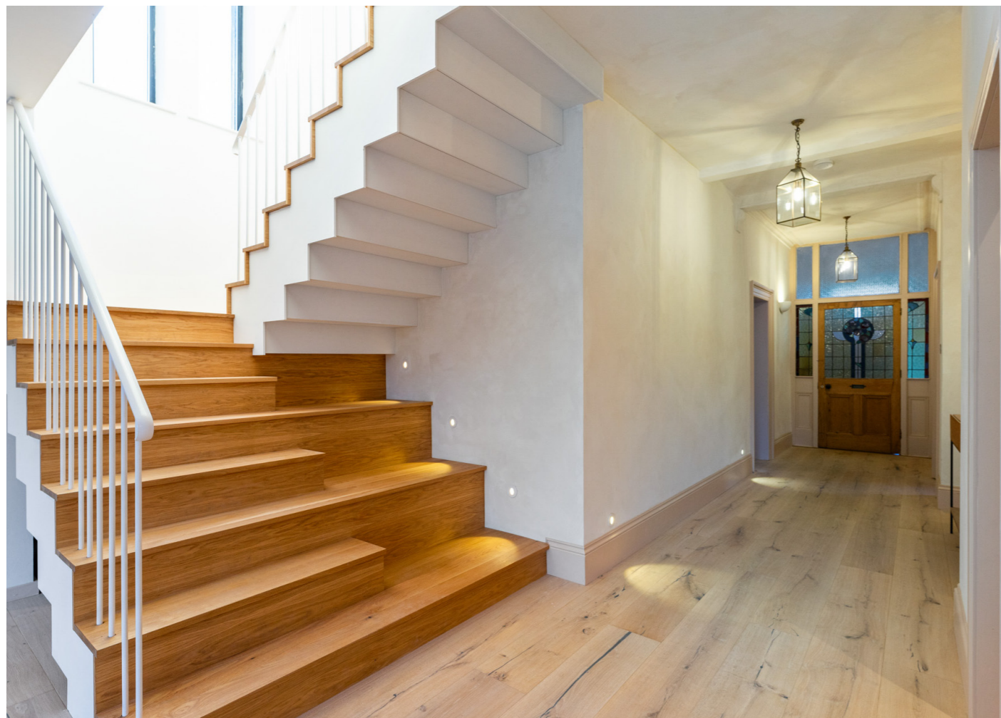
Impressive Reception hall with contemporary staircase