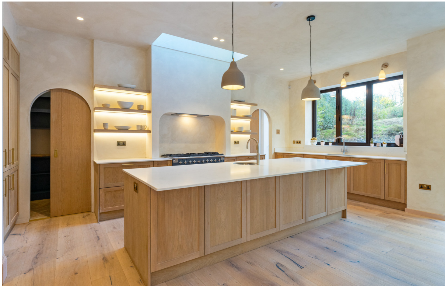
Centre island with breakfast bar