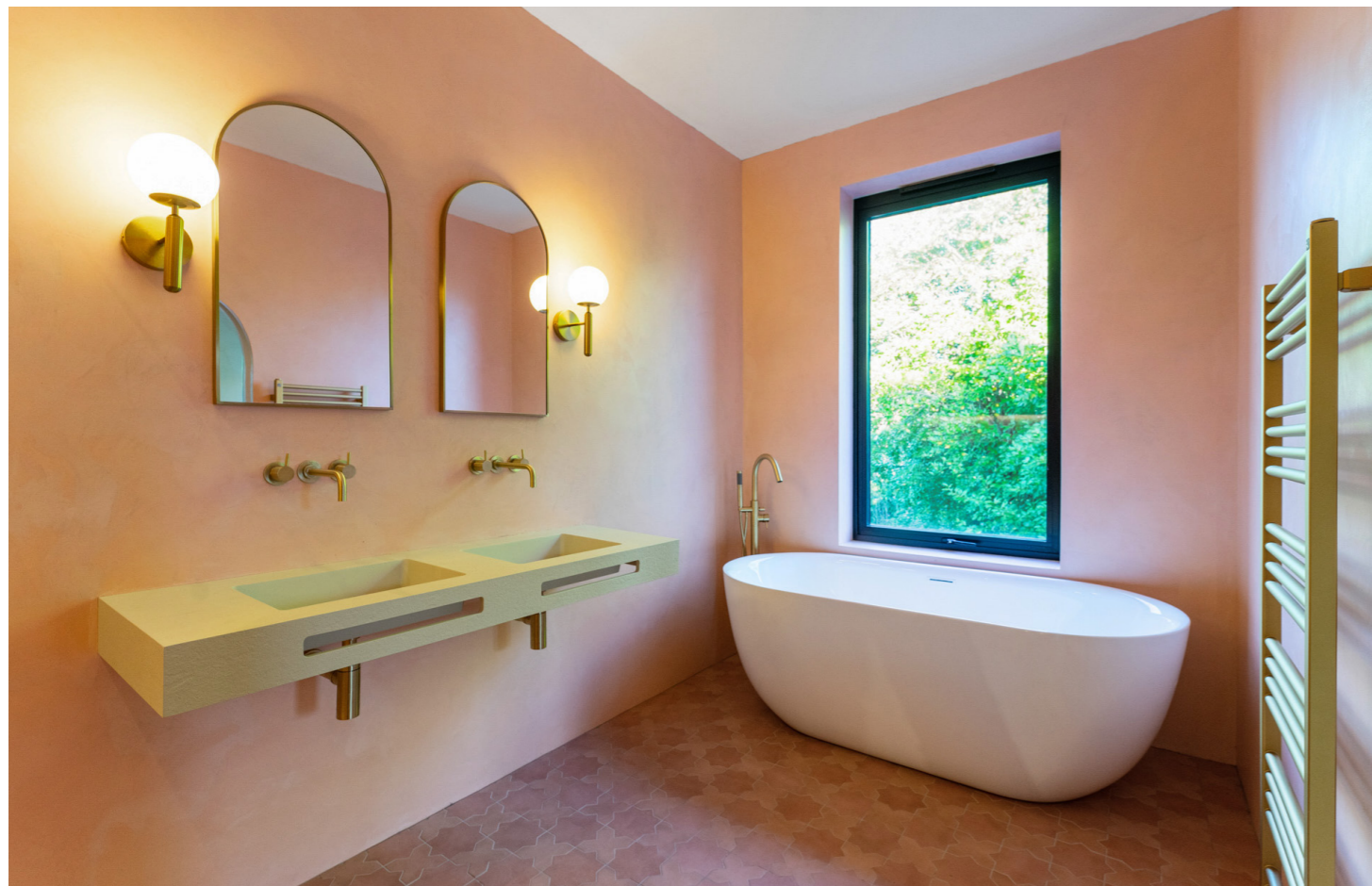
Ensuite bathroom with oval bath and feature twin basins