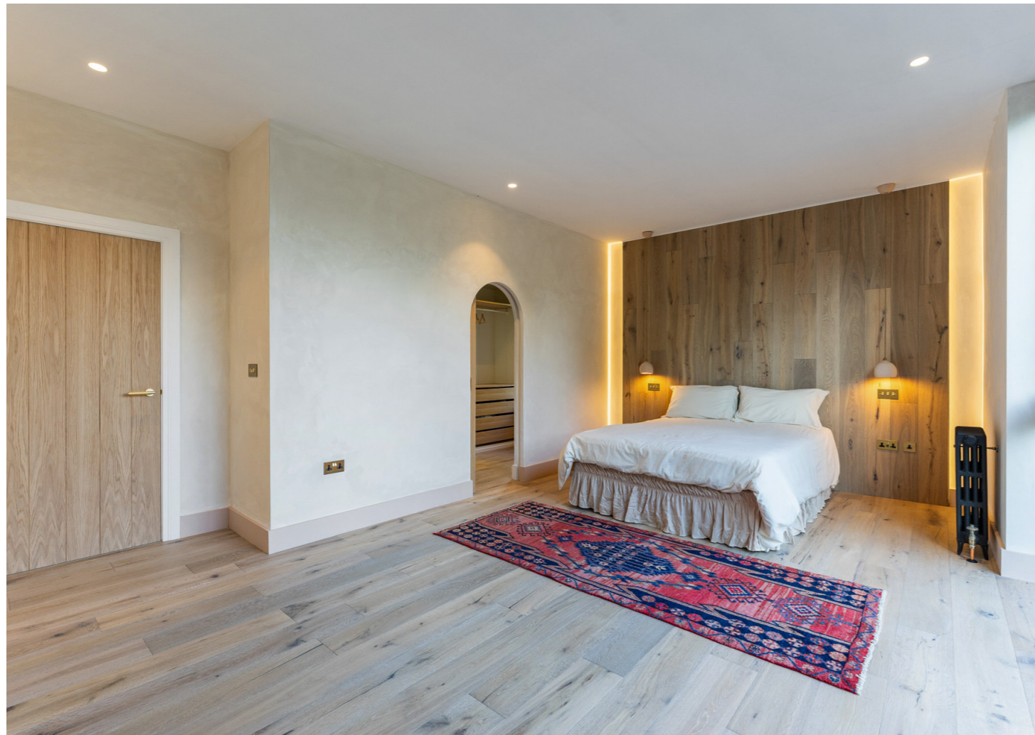
Bedroom one with feature wall and accent lighting