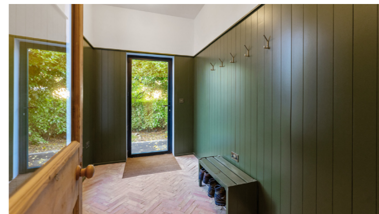
Panelled Boot room with direct outside access