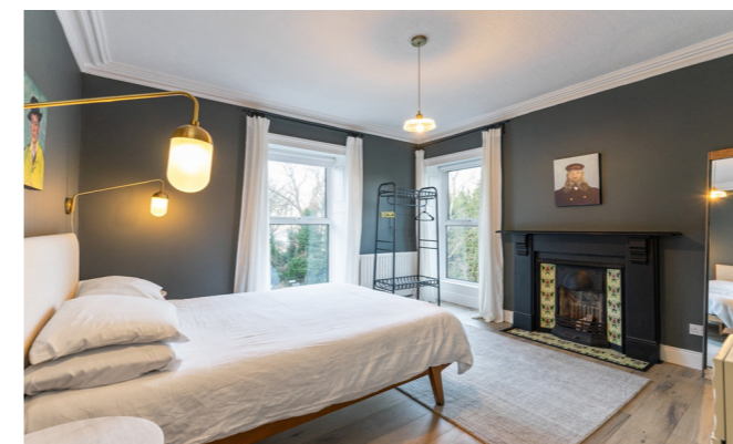
Bedroom three with double aspect and feature fireplace