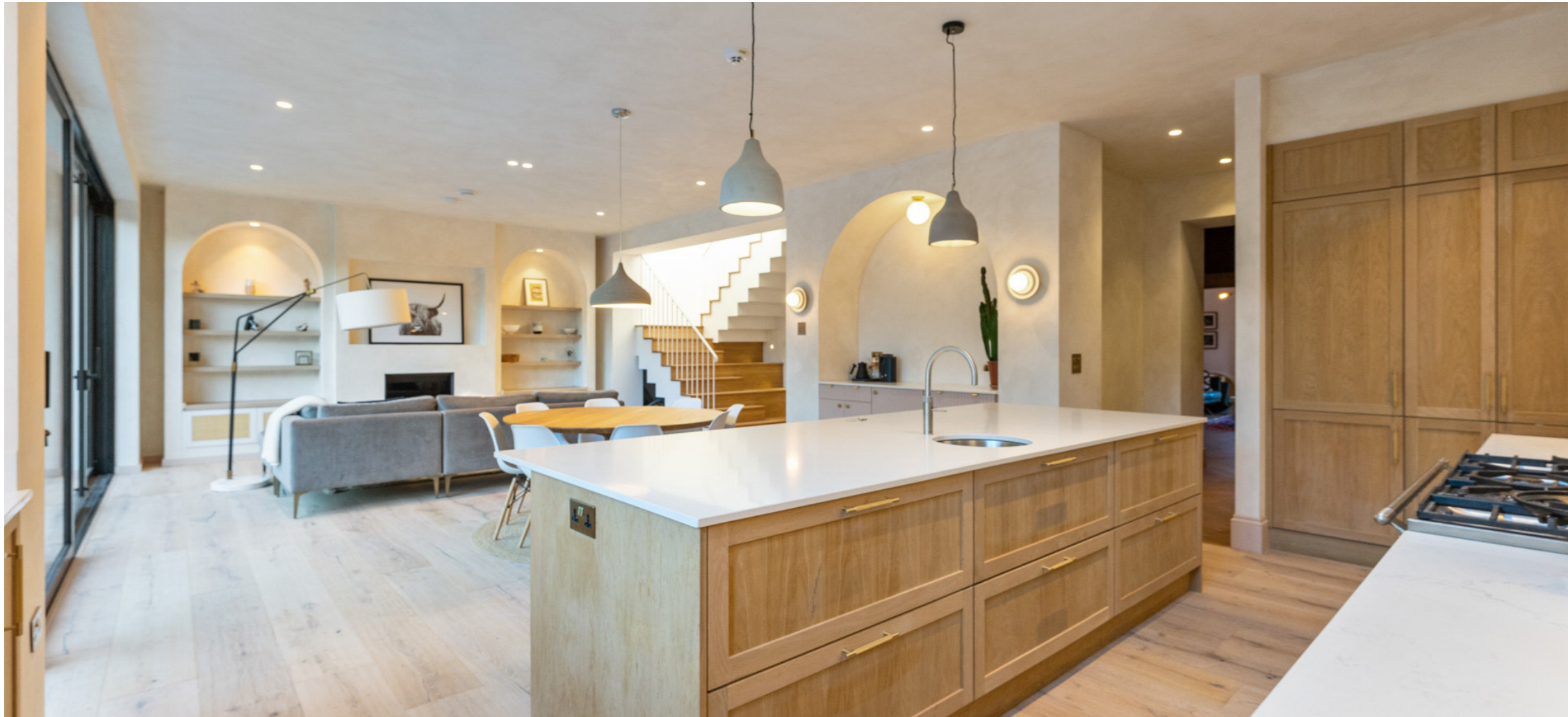
Stunning Living/kitchen/dining area