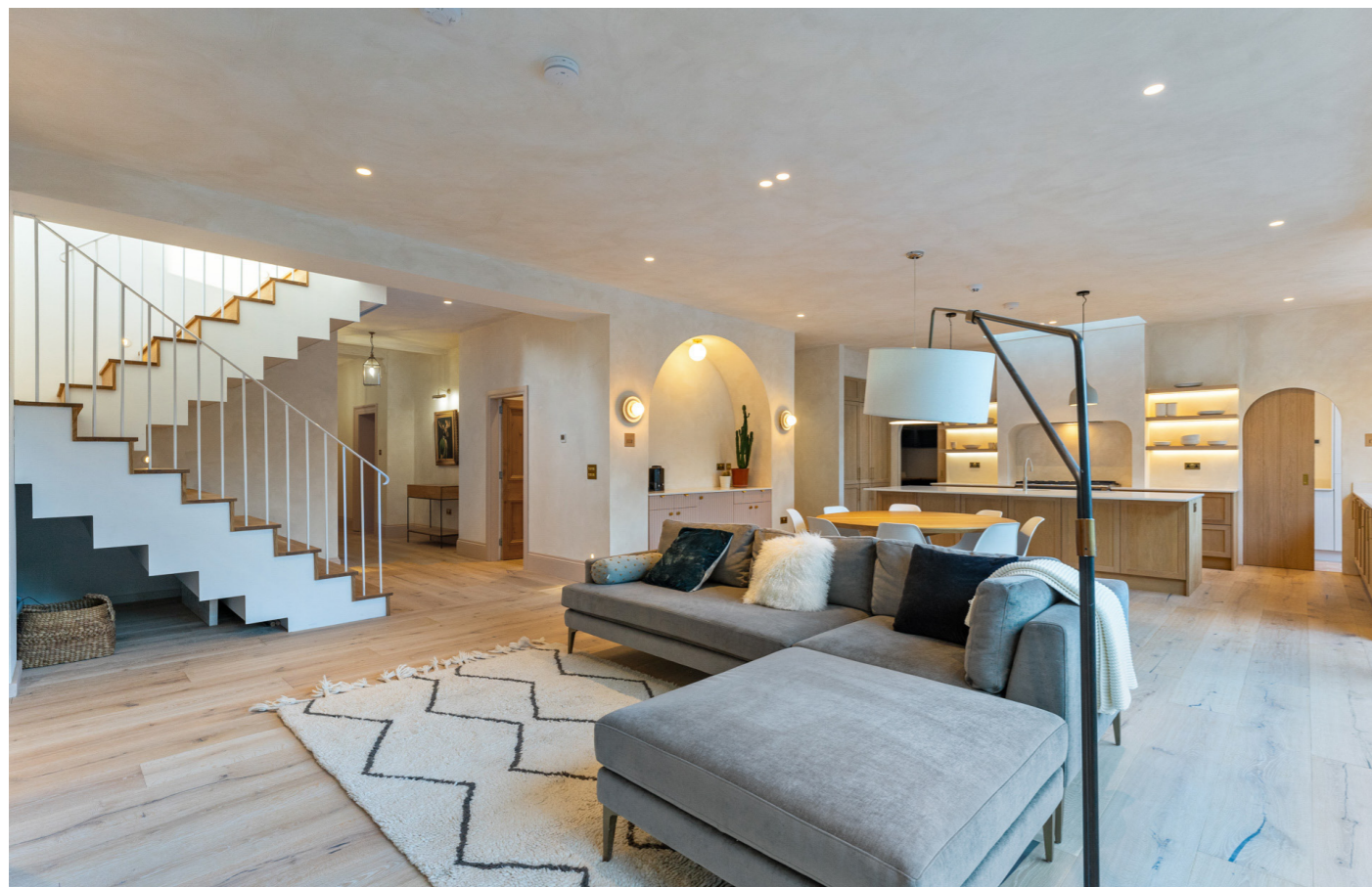
Impressive Open living / dining / kitchen