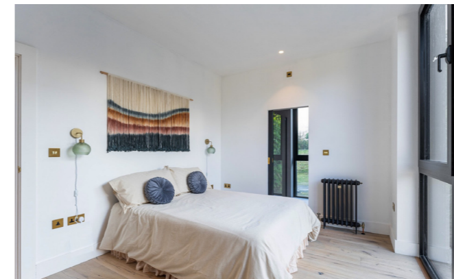
Bedroom two also with en suite