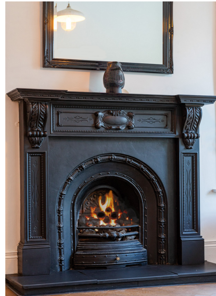
Feature period fireplace