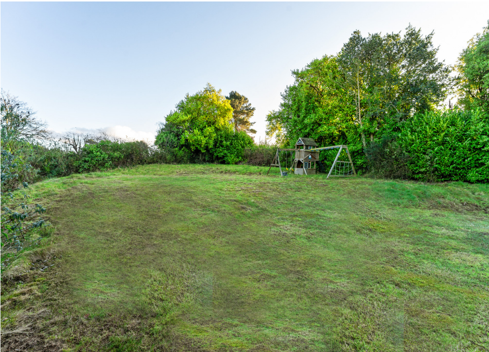
Large enclosed rear garden

Corner of Craigdarragh Road and Bridge Road opposite Crawfordsburn Country Park.