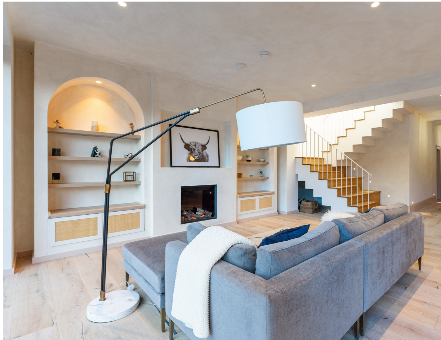
Comfortable Living area with gas fire