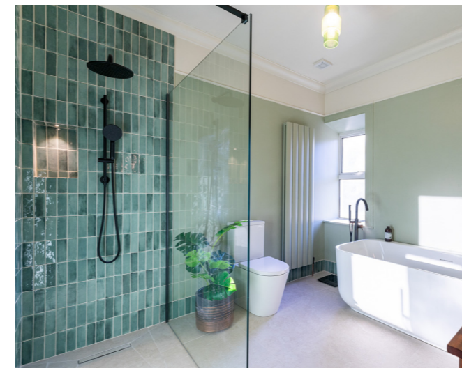
Family bathroom with bath and shower