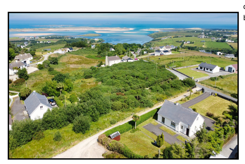
The house has a tarmacked driveway with mature hedged borders