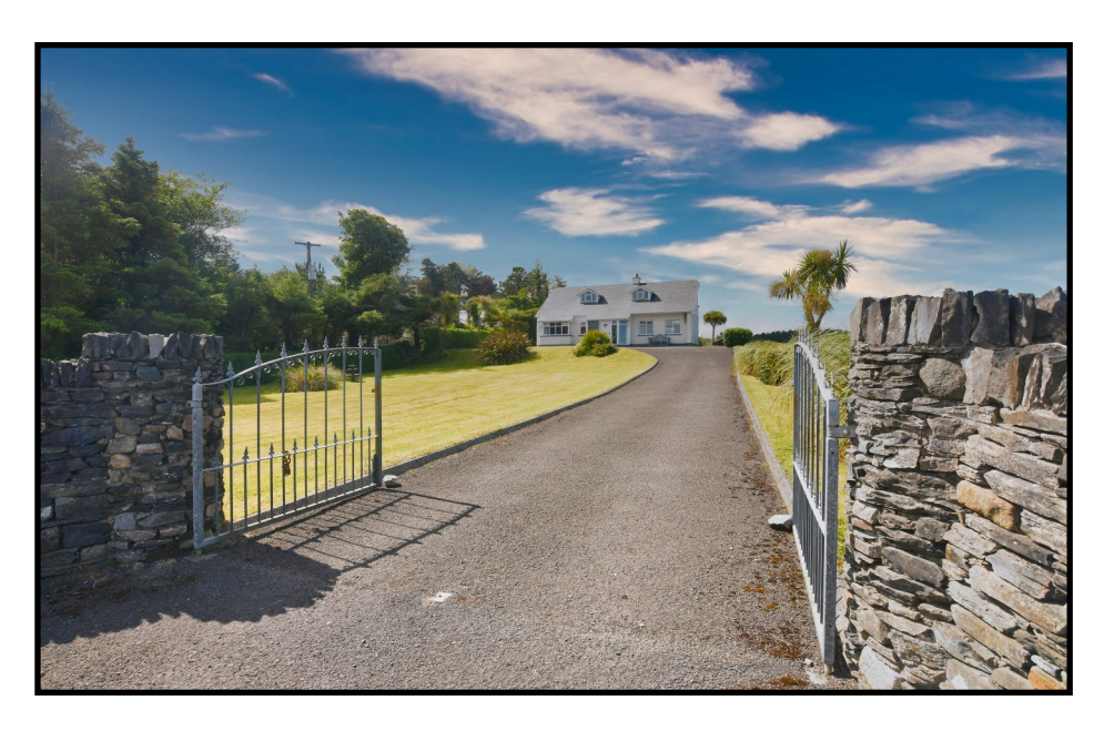
Location is everything