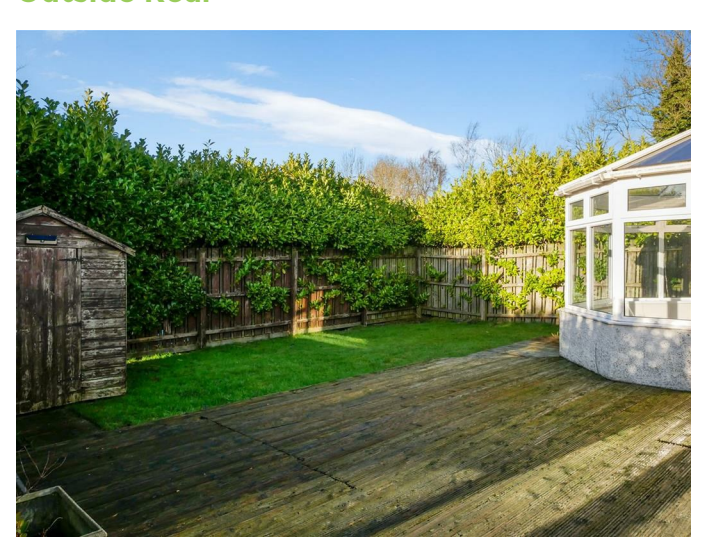
Enclosed rear garden area. Decked area, Patio area with garden laid in lawn.