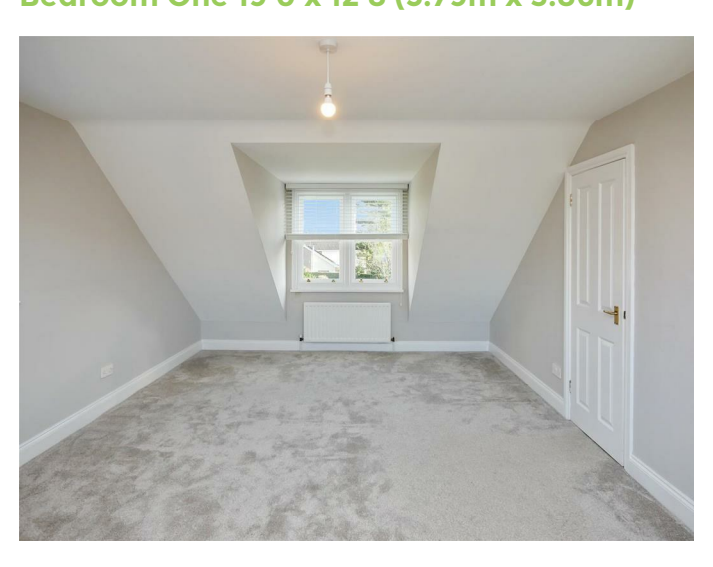
First Floor Bedroom One 19'0 x 12'8 (5.79m x 3.86m)

Comprising panelled bath with chrome shower unit above, pedestal wash hand basin, low flush w.c Part tiled walls. Tongue and groove ceiling. Spot-lights.