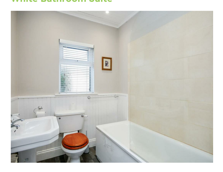
White Bathroom Suite

Comprising panelled bath with chrome shower unit above, pedestal wash hand basin, low flush w.c Part tiled walls. Tongue and groove ceiling. Spot-lights.