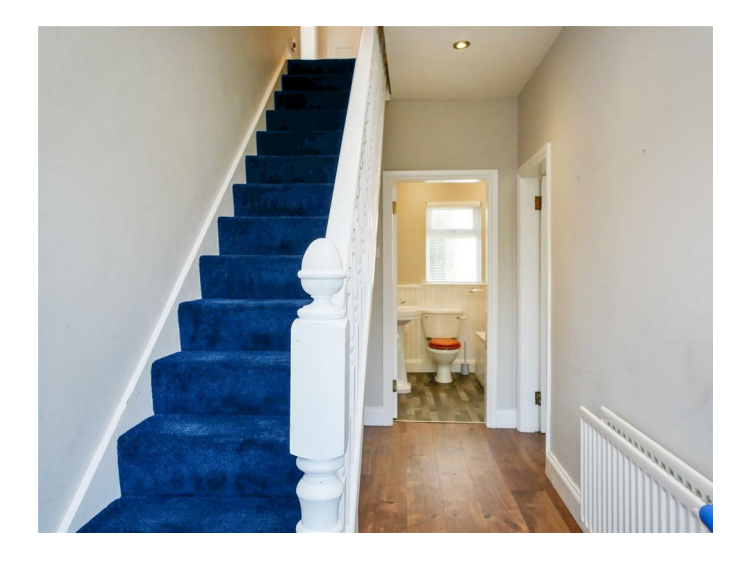
Hardwood front door with glazed side panels to entrance hall. Laminate flooring.