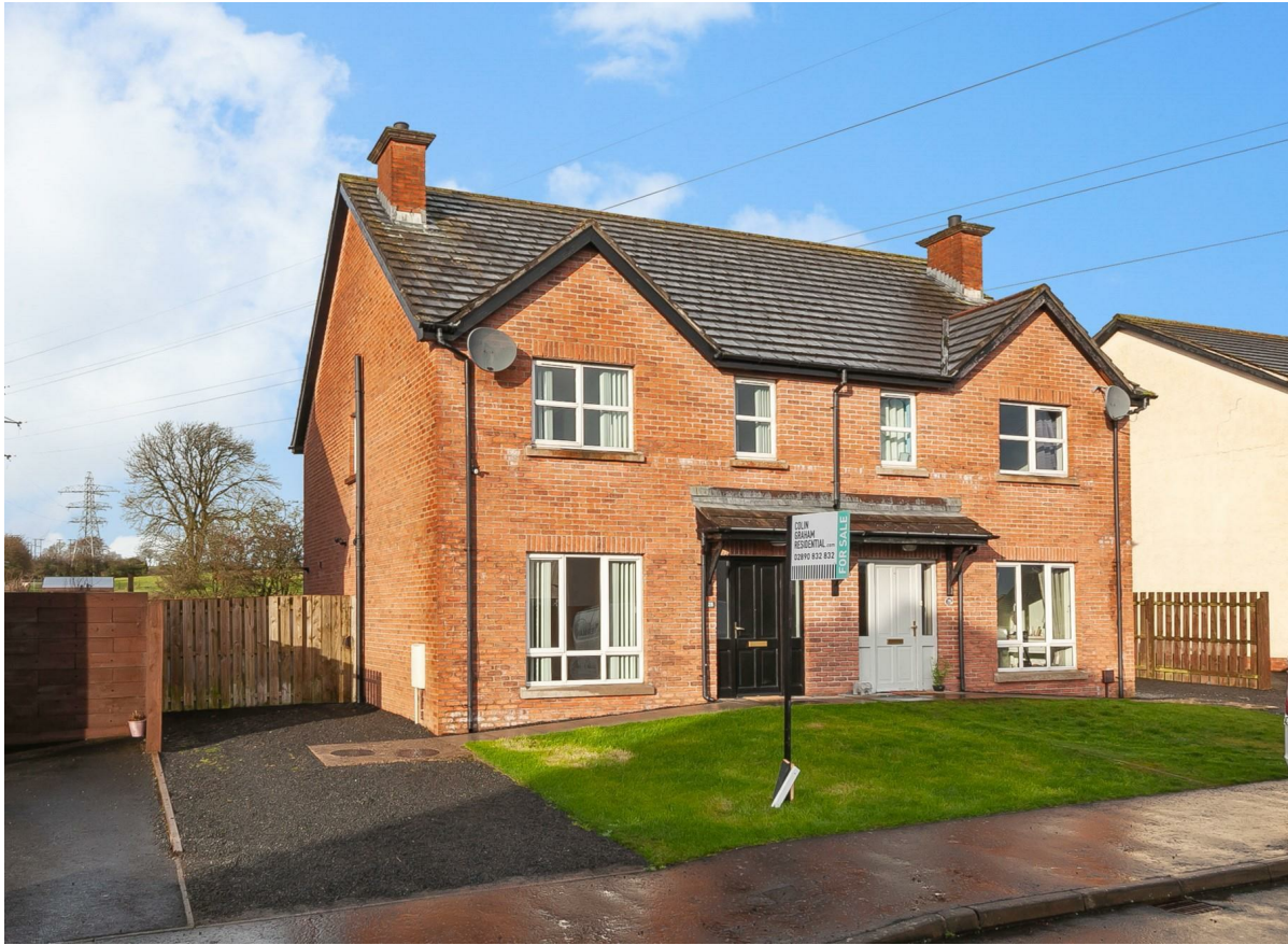
28 Porter Green Avenue, Larne, BT40 2UJ